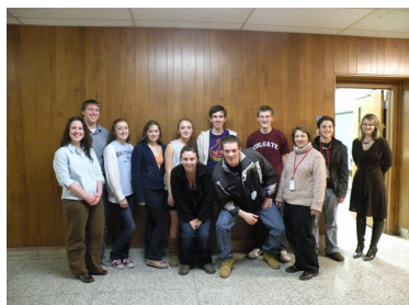
Youth Philanthropy Council 2009-2010

their year writing an RFP (Request for Proposal) through which they solicited grant proposals from local health and